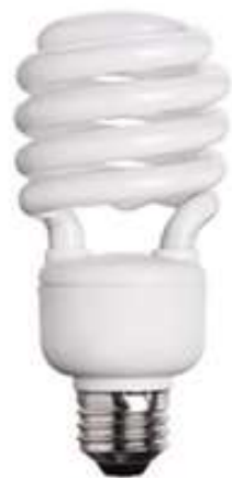
ENERGY-SAVING LIGHT BULBS