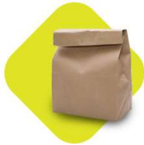
◆ REUSABLE BAGS