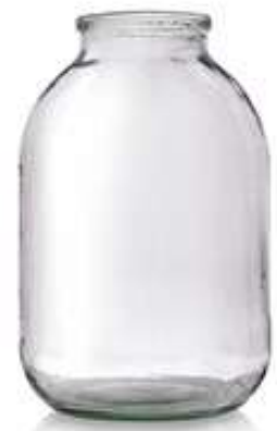
GLASS VESSEL WITH A TAPERED END

Did you know that you can prepare your own ecological fragrance in a simple and inexpensive way? Use a glass vessel with a tapered end and pour into it 1/4 cup of oil (e.g. almond) and about 30 drops of your favourite essential oil. Mix it and insert wooden sticks inside. You got it! Enjoy the wonderful smell for days.