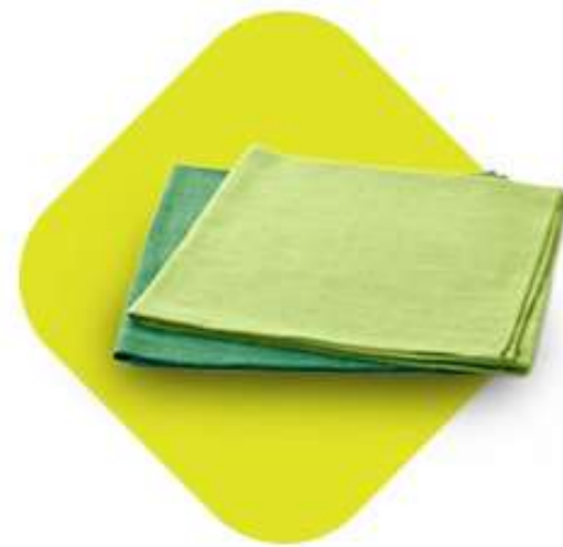
◆ BEES WRAPS