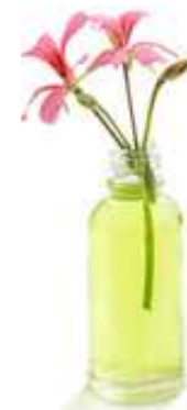
30 DROPS OF ESSENTIAL OIL