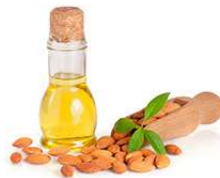
1/4 CUP OF ALMOND OIL